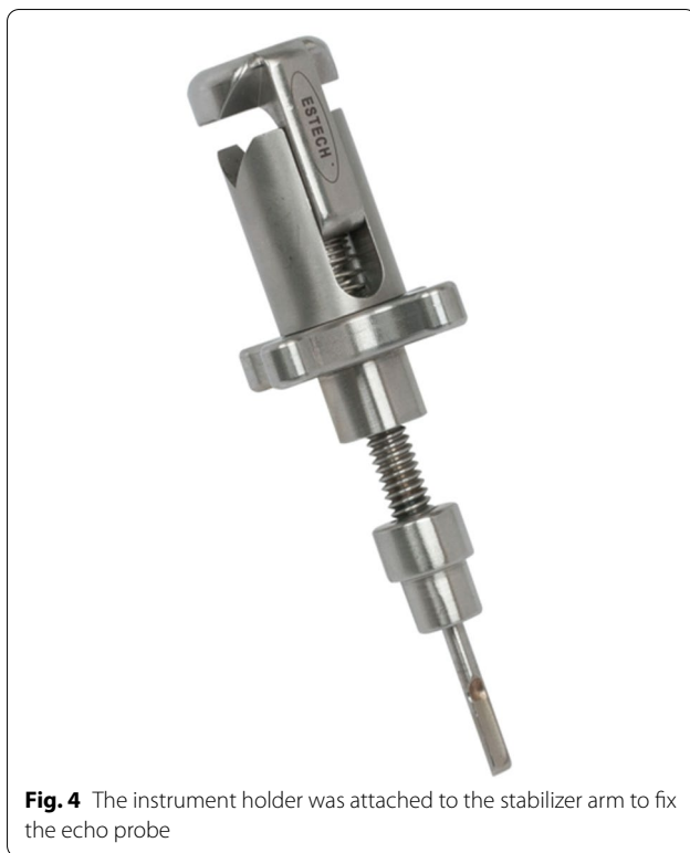
Fig. 4 The instrument holder was attached to the stabilizer arm to fix the echo probe